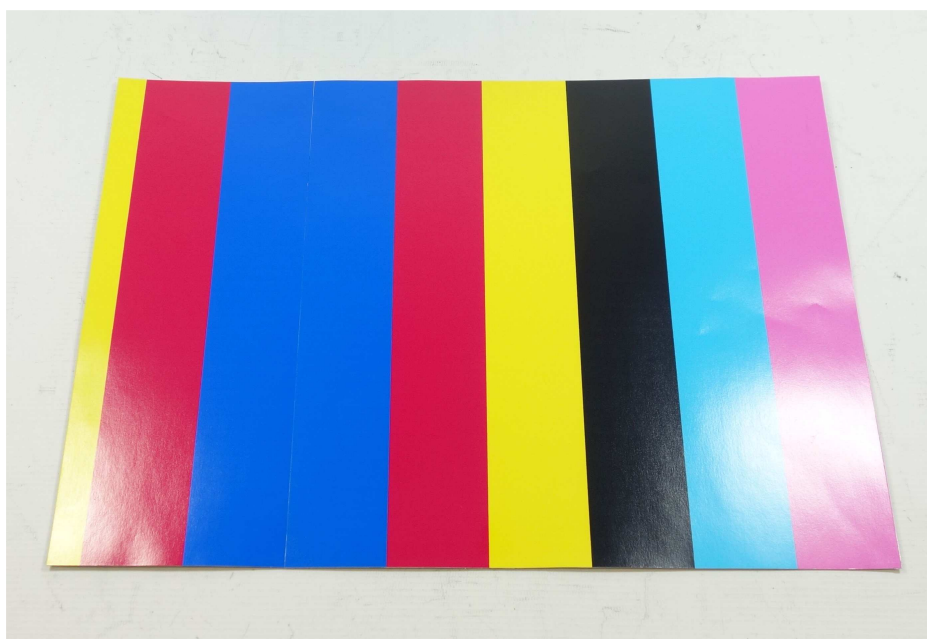
A001: Epson UltraChrome RS ink